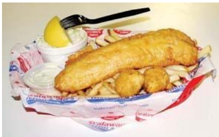
A nice plate of walleye prepared without trans-fats.